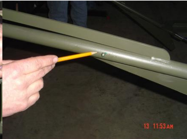
Shaft Tube Grease Zerk