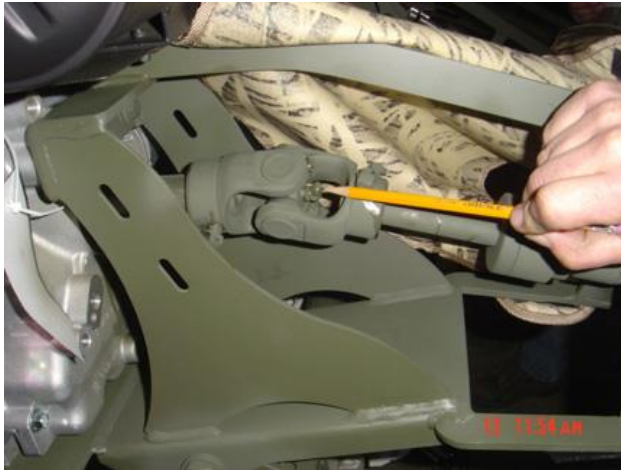
Zerk for u- joint. All models