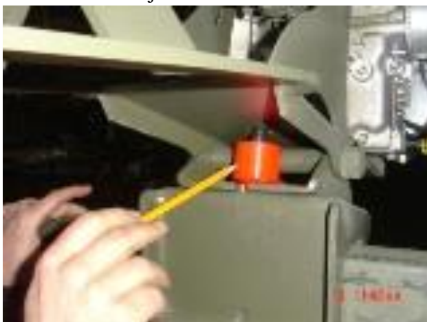
Rubber Trim Adjuster