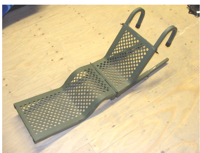
Parts included in kit